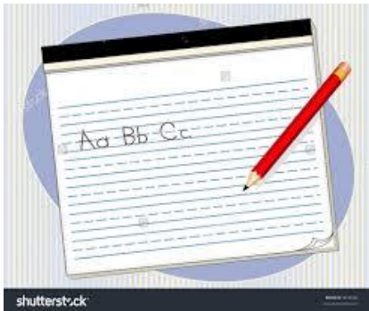
ABC writing tablet (1 st & 2 nd gr.)