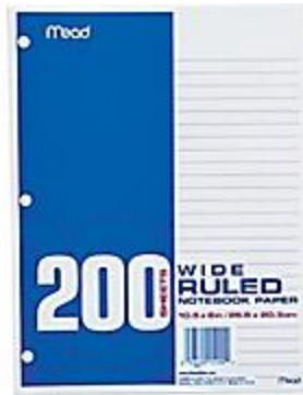
wide ruled notebook paper