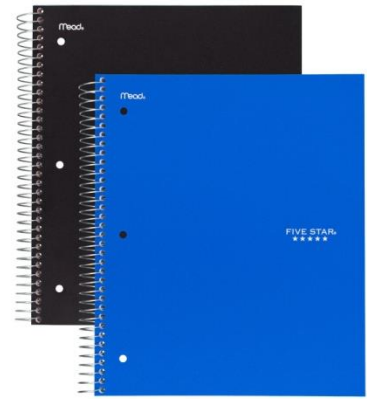
or spiral bound notebook paper