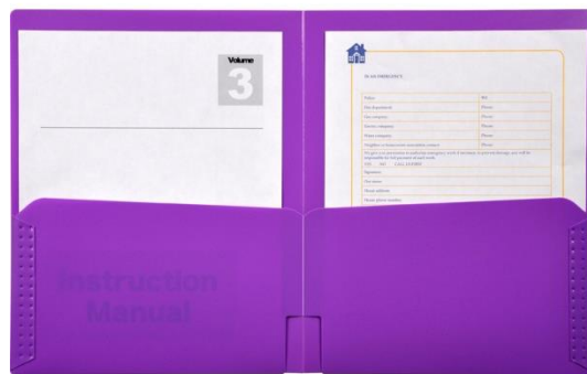
pocket portfolio (plastic)